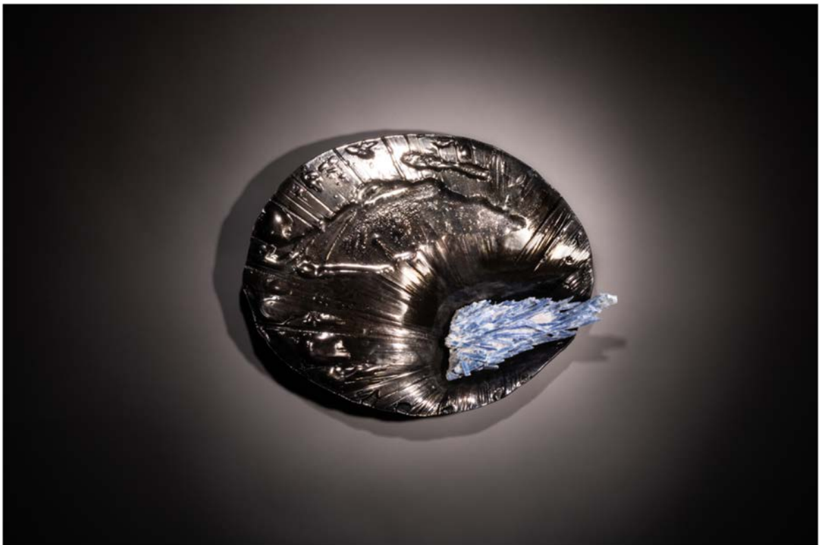
STUDIO GREYTAK: Impact Wall Mount Kyanite