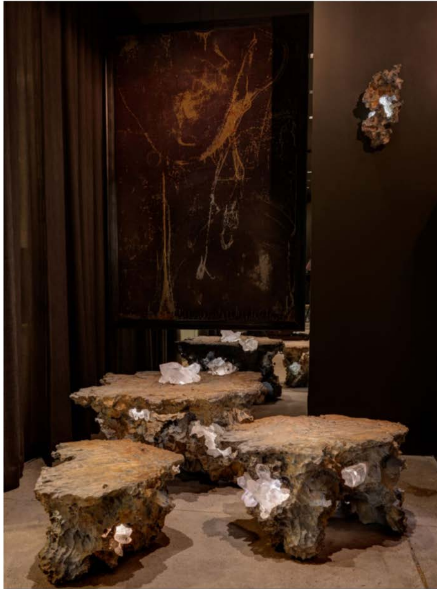
STUDIO GREYTAK: EROSION LUMINAIRE TABLES

If you would like to explore these universal forces you can schedule a tour with Guy Regal NYC at the New York Design Center.