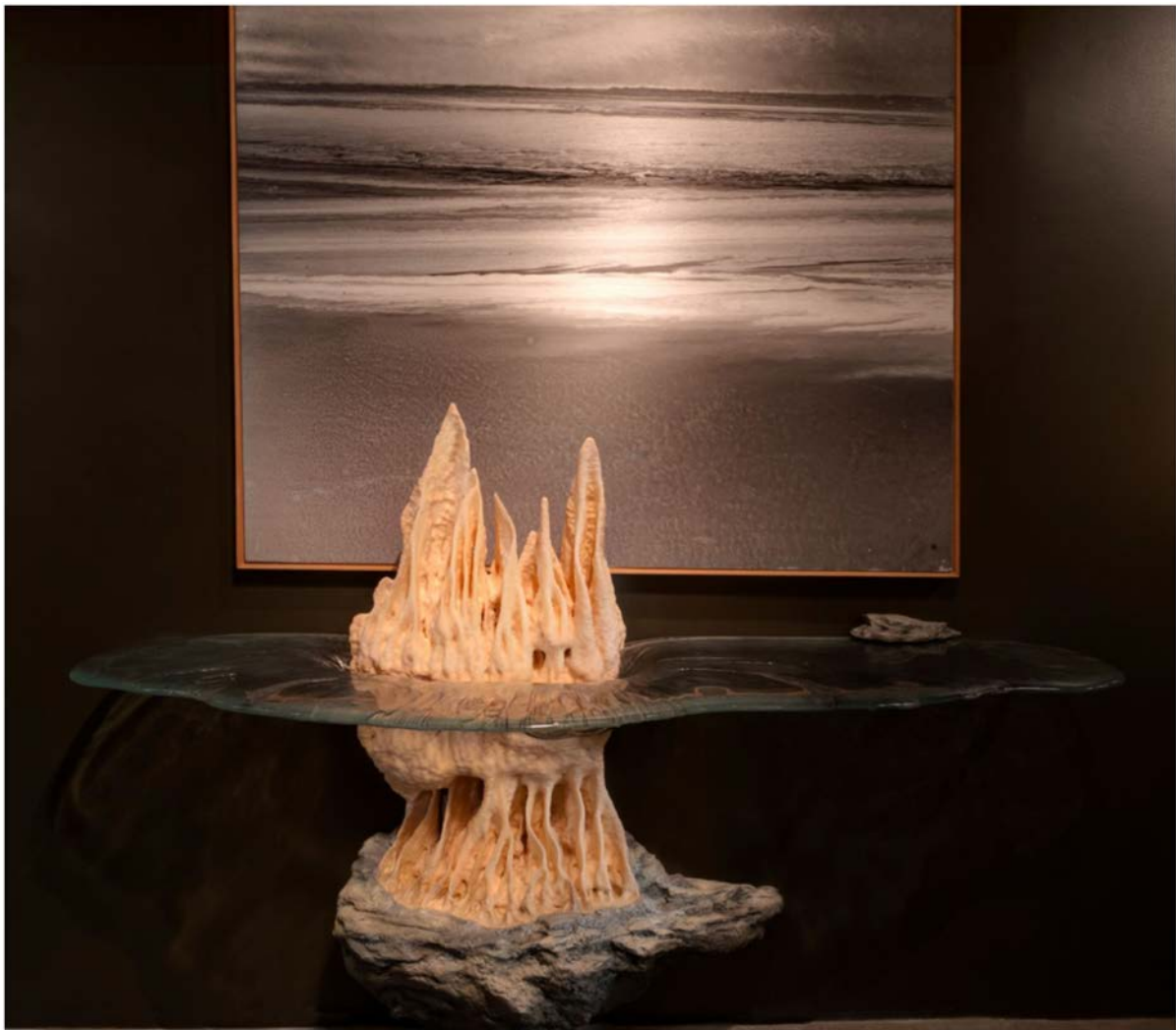
STUDIO GREYTAK STALACTITE IMPACT CONSOLE